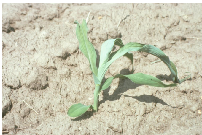
Figure 4. Below-ground feeding injury