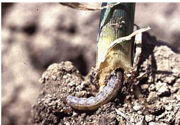
Figure 1. Black cutworm larva

Loss of stand prior to emergence or due to above-ground cutting or below-ground tunneling injury often indicates presence of black cutworm (BCW) (fig. 1). Adult moths (fig. 2) of the BCW overwinter in the south and migrate north with the prevailing spring weather fronts. The intensity and distribution of the migratory BCW flight may differ from year to year due to this migration. Some regions such as the Ohio River valley often exhibit higher levels of BCW activity than other regions such as the areas bordering the Great Lakes. Within a region, migrating BCW moths tend to be attracted to fields having a significant ground cover of winter annuals such as chickweed at the time of peak migratory flights. Since the accumulation of winter annuals is often associated with reduced tillage or no-tillage systems, the incidence of BCW infestations tends to be linked to tillage practices and weed management. Late tillage prior to corn planting may not reduce BCW infestations if significant weed cover was present at the time of peak egg laying by migratory BCW moths. Thus, reduced tillage or no-tillage corn may be equally susceptible to BCW infestation if the corn crop follows a no-tillage corn or soybean crop that enabled development of a significant stand of winter annuals, which are attractive sources for egg laying by migratory BCW moths. In terms of weed management, fall tillage can give growers a start in providing weed-free fields in the spring.