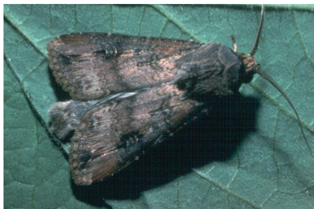
Figure 2. Black cutworm adult