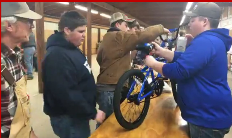
Junior Leaders assemble Bikes for Kids at the December meeting.