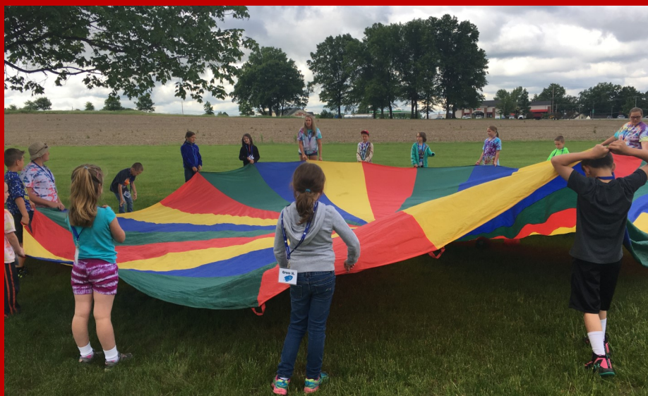
Cloverbuds had fun at Cloverbud Camp with the parachute!