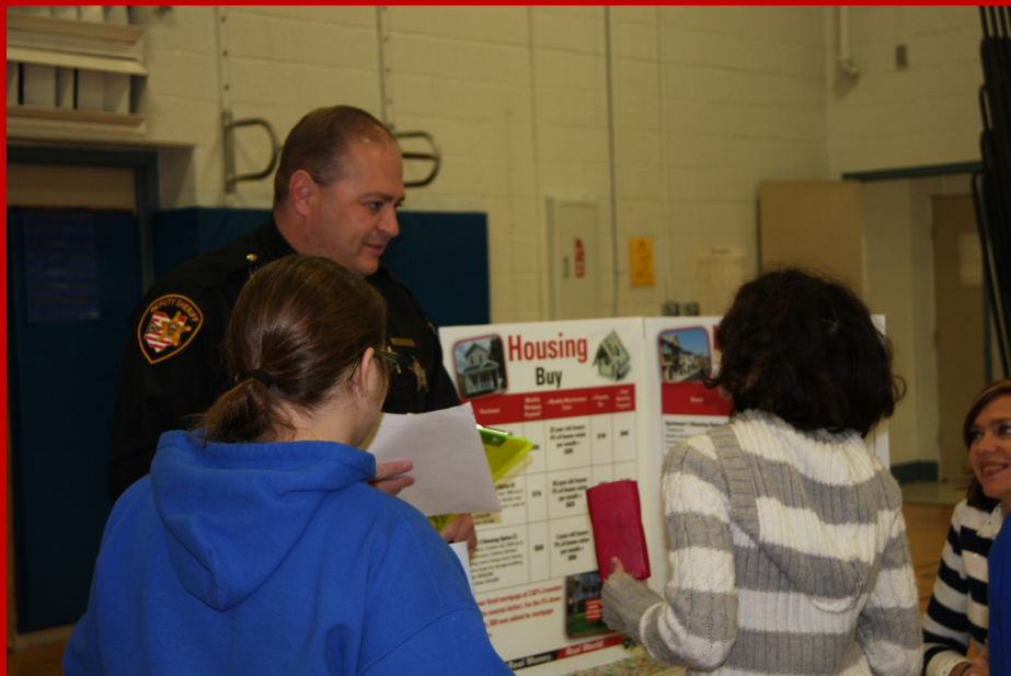
Real Money, Real World teaches middle and high school students about budgeting.