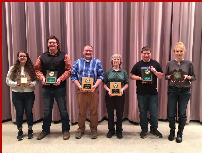
2018 Award Winners