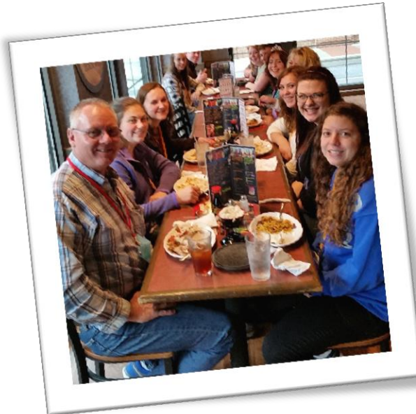
The Sr. Fair Liason committee took our Jr. Fairboard to the Mongolian Grill in Columbus while attending the OFMA

Extension Educator, 4-H Youth Development